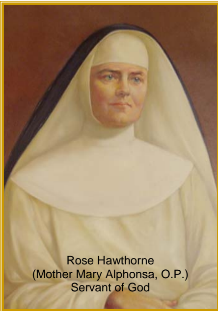
Rose Hawthorne (Mother Mary Alphonsa, O.P.) Servant of God