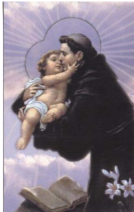
St. Anthony pray for us