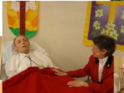
Easter dinner with patients and families.