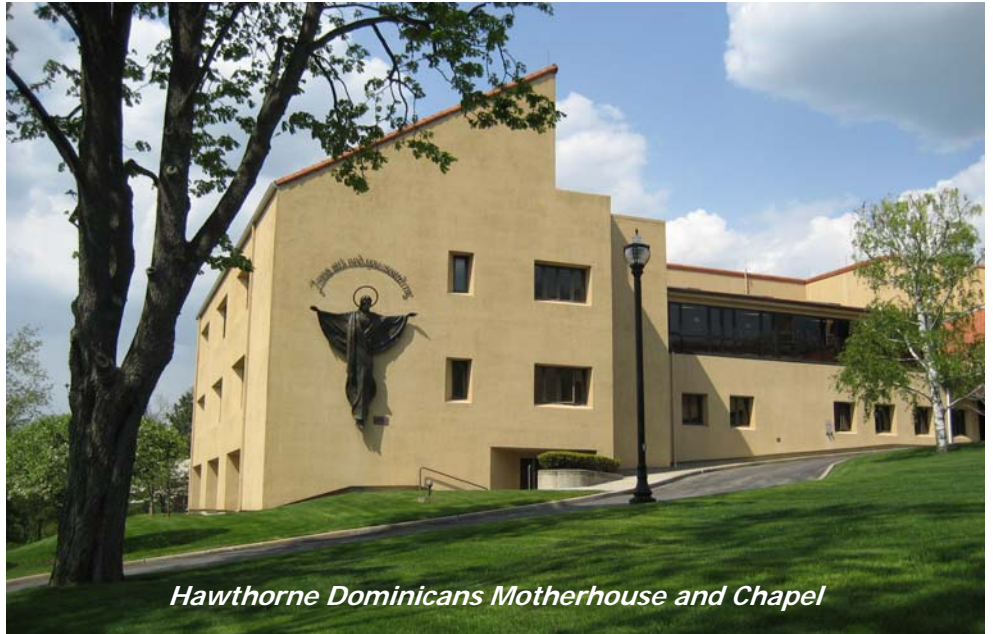
Hawthorne Dominicans Motherhouse and Chapel