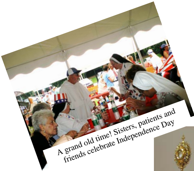
A grand old time! Sisters, patients and friends celebrate Independence Day