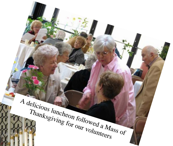
A delicious luncheon followed a Mass of Thanksgiving for our volunteers